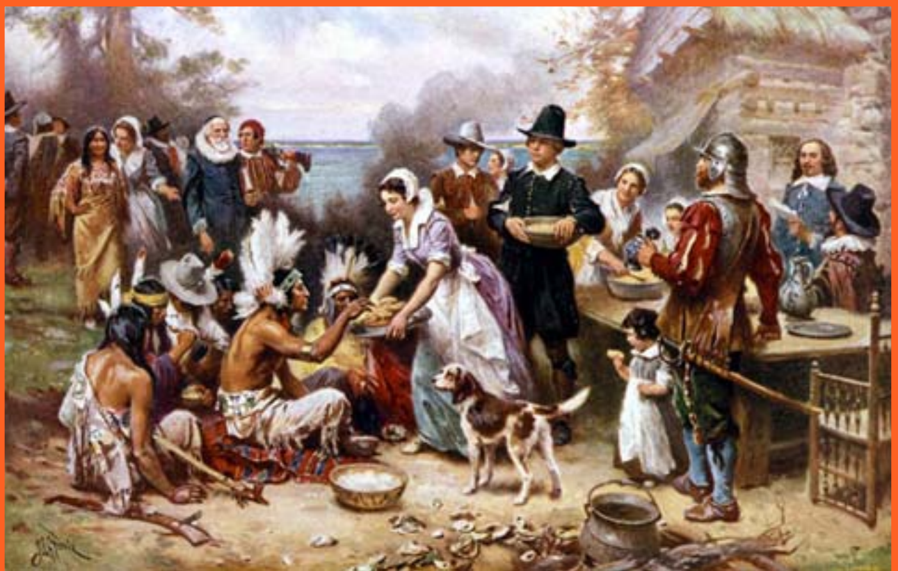
The First Thanksgiving, reproduction of an oil painting by J.L.G. Ferris, early 20th century.