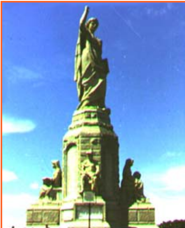
Statue of Faith Pilgrim Monument

"If the blessings of our political and social condition have not been too highly estimated, we cannot well overrate the responsibility and duty which they impose upon us. We hold these institutions of government, religion, and learning, to be transmitted, as well as enjoyed. We are in the line of conveyance, through which whatever has been obtained by the spirit and efforts of our ancestors is to be communicated to our children.