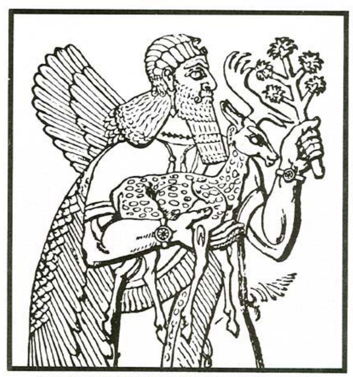
ANCIENT BABYLONIAN DRAWING OF NIMROD (BAAL) 2000 BC