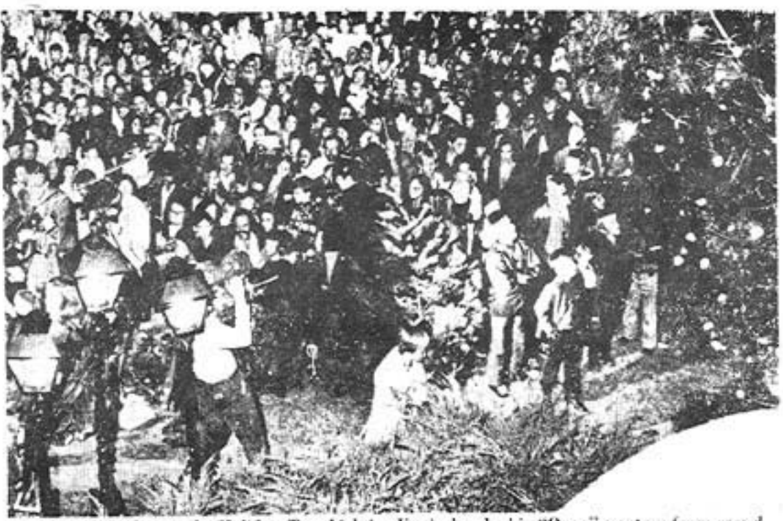
the lights flicked on at the Holiday Tree Lighting Festival and a big "Oooo" went up from crowd