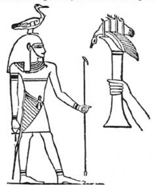
The Egyptian God Seb, with his symbol the goose; and the Sacred Goose on a stand, as offered in sacrifice.

In India, they have the "Brahmany goose," sacred to Brahma. In Babylon, the goose was offered as a sacrifice by the priests of Baal. Wilkinson (Egyptians, Vol. V, page 227), states that ancient Egyptian heiroglyphics indicate the goose symbolized a son, giving itself up in